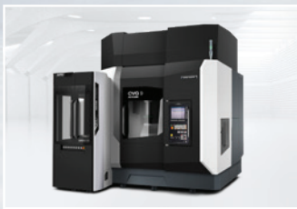
CNC Vertical Multi-Process Grinding Machine CVG-6 with APC system