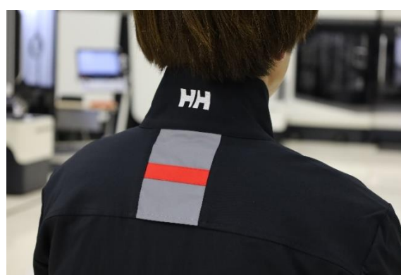
Reflective material on the back