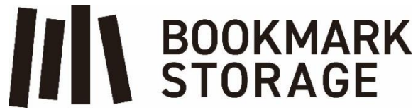
BOOKMARK STORAGE logo