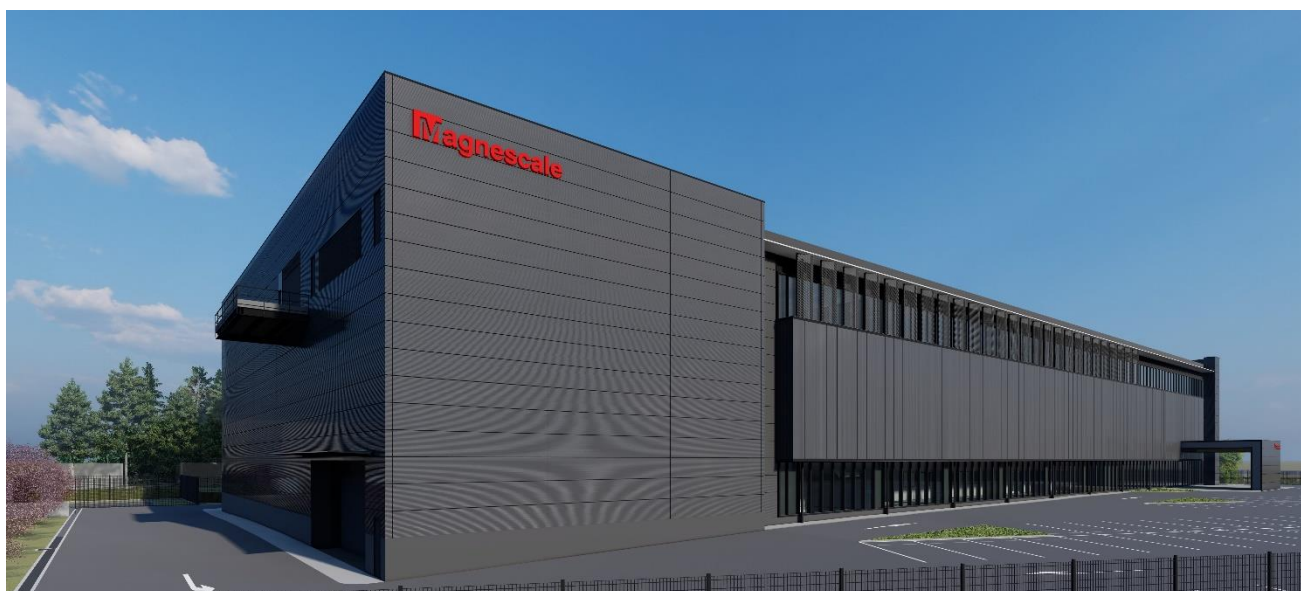
Design of Magnescale's Nara Plant

Note : Acquired measuring instrument business of Sony Manufacturing Systems Inc. and joined DMG MORI Group as Magnescale Co., Ltd. in 2010