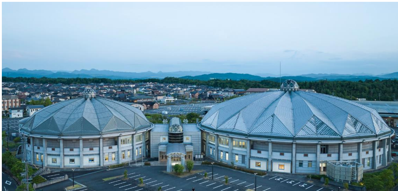
DMG MORI Arena

Outline : Iga Campus was established in 1970 and is the largest production site of the DMG MORI Group. It includes assembly and machining plants, the R&D Center with approximately 400 engineers, the Global Solution Center as one of the world's largest showrooms with approximately 60 state-of-the-art machines, the Service Center that responds to customer inquiries and requests, as well as the DMG MORI Academy for training with the latest machine tools.