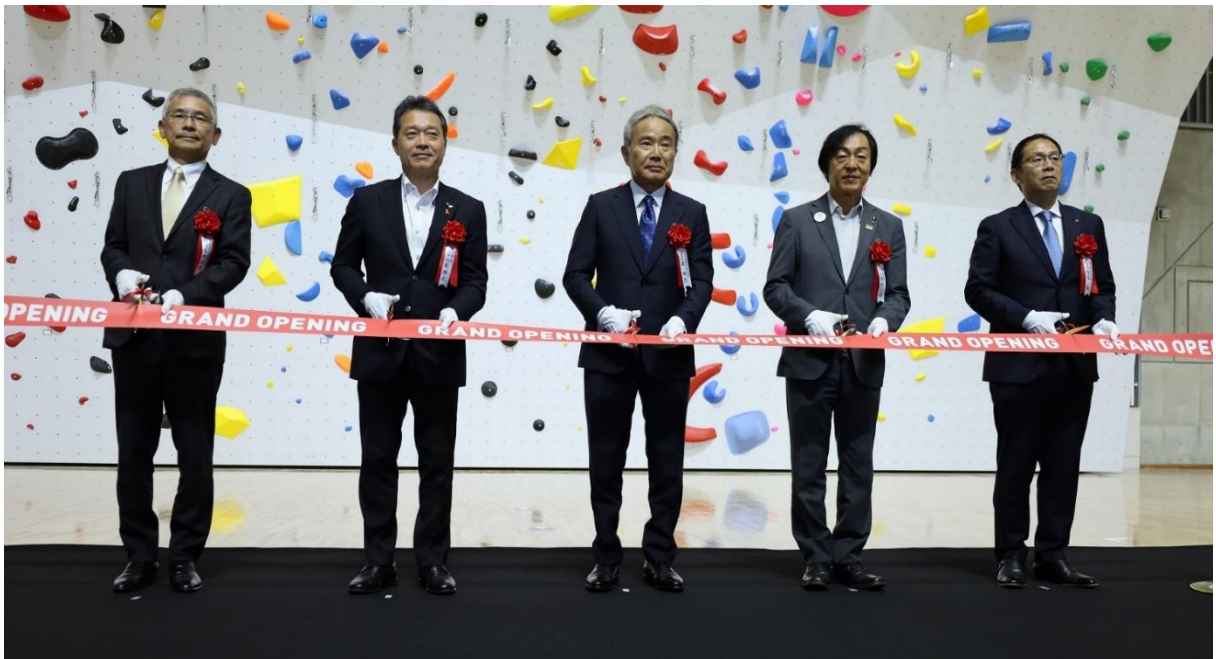
DMG MORI Arena Opening Ceremony