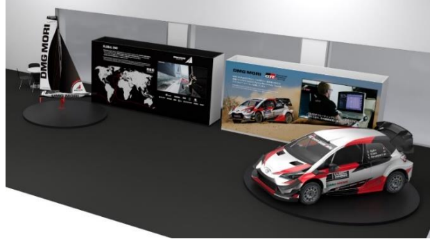
Sports Marketing Area