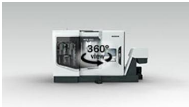
New function: 360° VIEW

*Members-only contents can be viewed by membership registration (free).