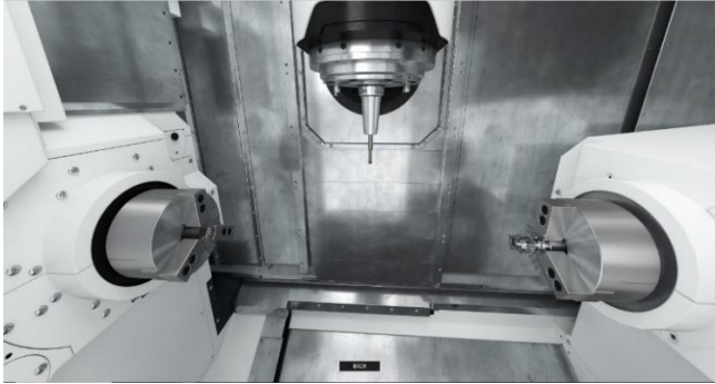
New function: INSIDE VIEW