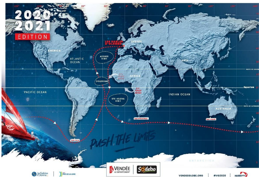
Course of the Vendée Globe 2020-2021