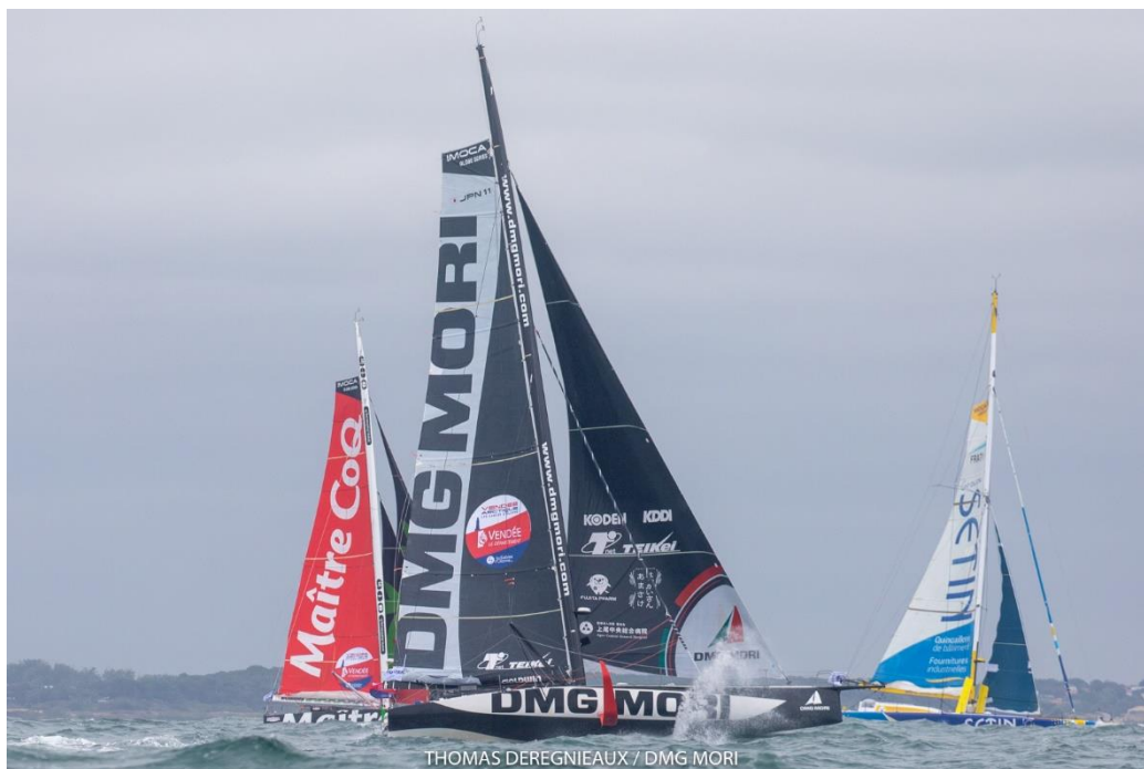
DMG MORI Global One upon departure