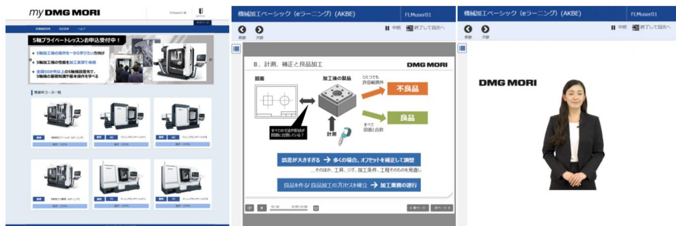
Digital Academy e-learning