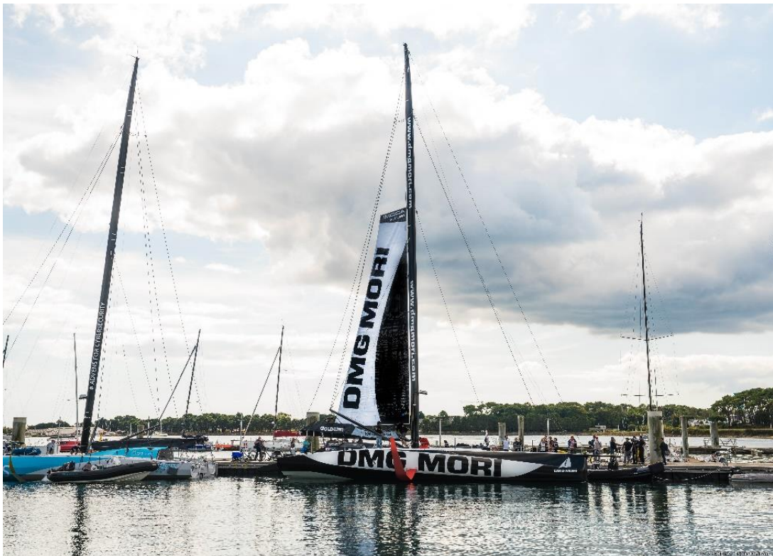
“DMG MORI Global One”

Already more than 12,000 employees at DMG MORI are actively shaping the future. With 157 sales and service locations – thereof 14 production plants – we are present worldwide and deliver to more than 100,000 customers from 42 industries in 79 countries.