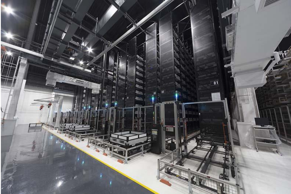
Iga Global Parts Center equipped with the latest automated systems