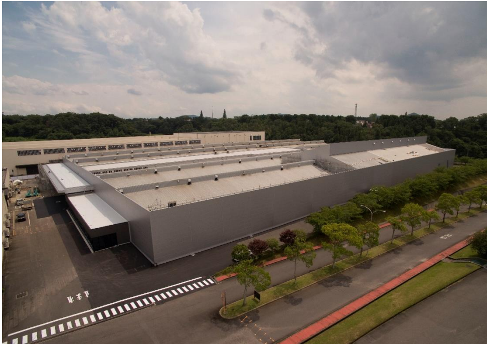
External view of Iga Global Parts Center