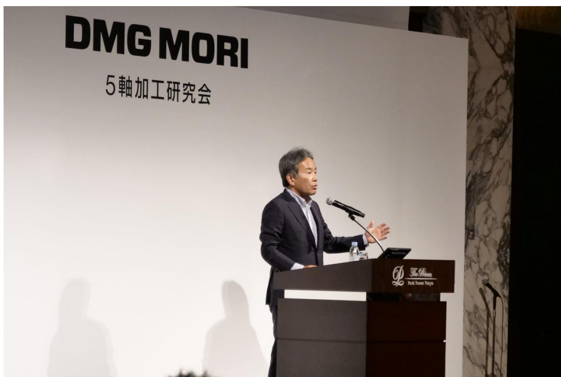
President's speech at the opening ceremony