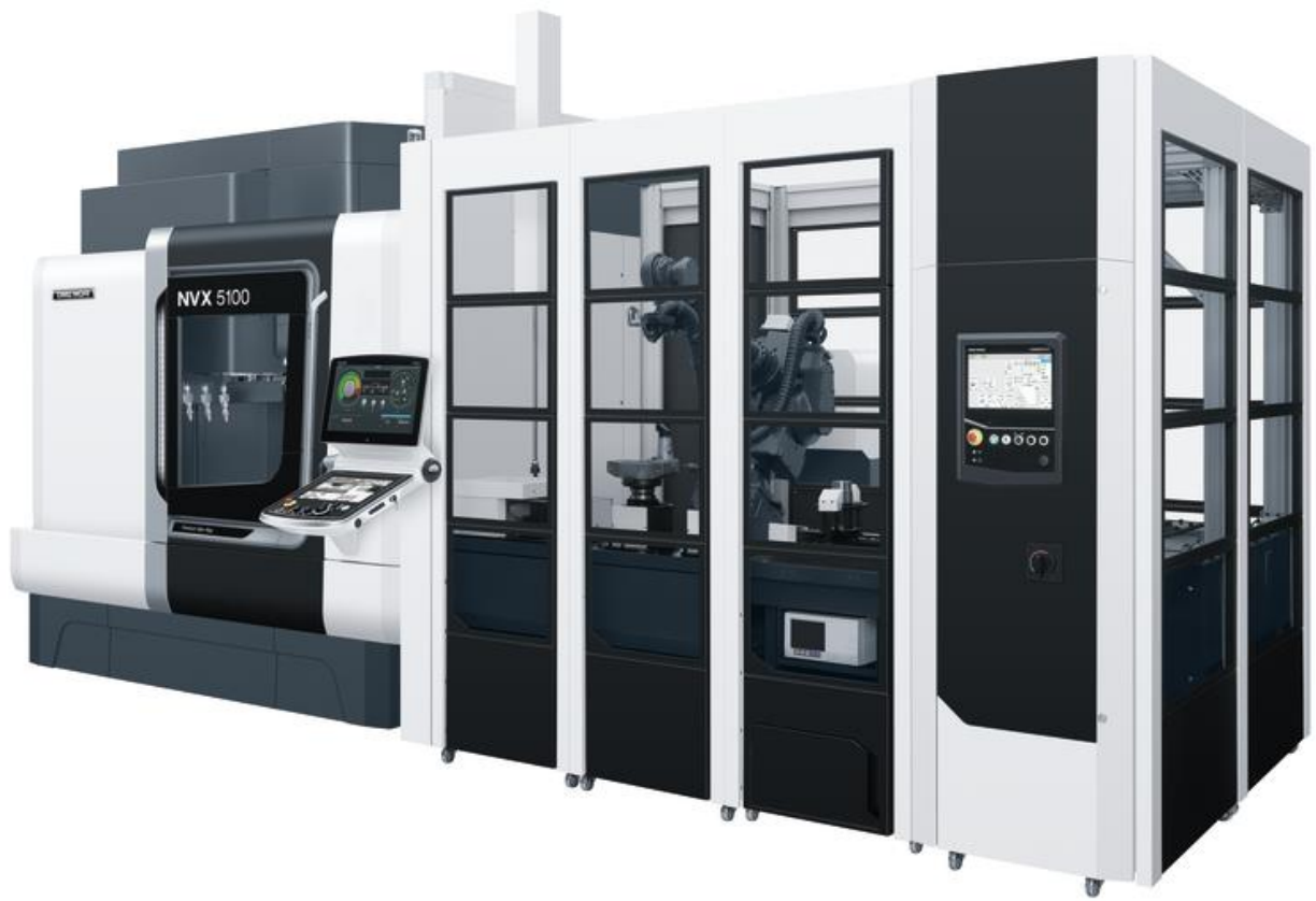
Photo 3. Modular robot system