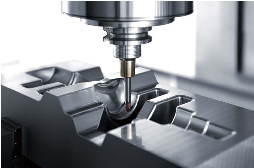
Photo 2. Machining