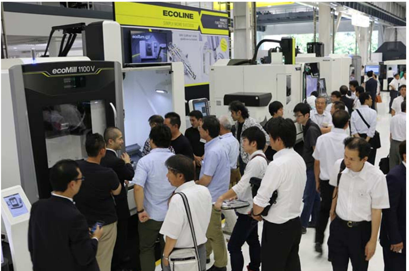
ecoMill V series