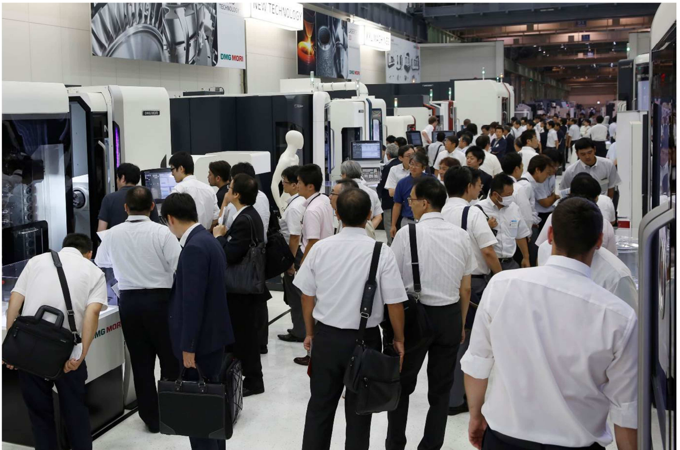
Remodeled exhibition site