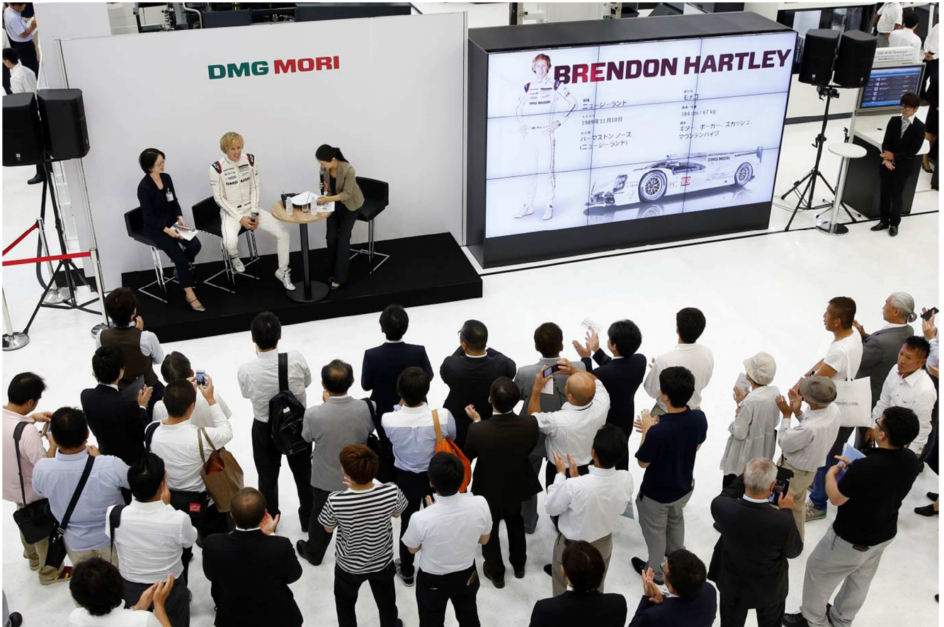
Porsche special event